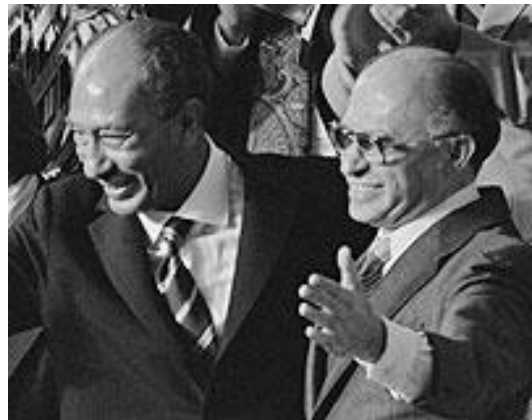
Then Egyptian president Anwar Sadat and Israeli prime minister Menachem Begin in 1978.

After 12 days of closed talks between Israeli and Egyptian delegations at Camp David in the U.S., the two sides sign the two-part Camp David Accords. 3 The first section deals with the future of the Sinai Peninsula and peace between Israel and Egypt, and calls for a peace treaty to be signed within three months that stipulates a full Israeli withdrawal from Sinai. The second part outlines a framework for establishing autonomous Palestinian rule in the West Bank and Gaza Strip.