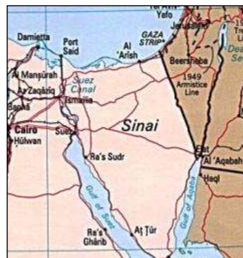
Map of Israel-Egypt border

Egypt and Israel trade under special MFN (Most Fair Nation) status of the World Trade Organization. 18