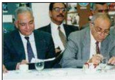
1996 agricultural deal signed by then Egyptian ambassador to Israel Mohamad Bassiouny and Israel's agricultural minister Yaacov Tsur.

Although Egypt's GDP grew nearly 5 percent in 2010 (amounting to $30 billion worth of exports), one in four Egyptians are unemployed, according to Al Jazeera TV.