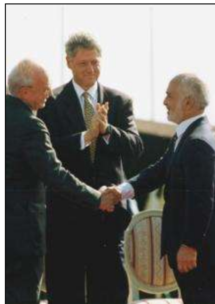
Bill Clinton, Yitzhak Rabin and King Hussein of Jordan at the peace treaty signing ceremony.

In the same year, Jordan, the Palestinian Authority and Israel approved the construction of an agro-industrial park 9 in the West Bank to foster economic cooperation and development throughout the region. The Jordan Gateway Industrial Park, located outside Jordan's capital, Amman, is another example of the fruits of the Jordanian-Israeli peace accord.