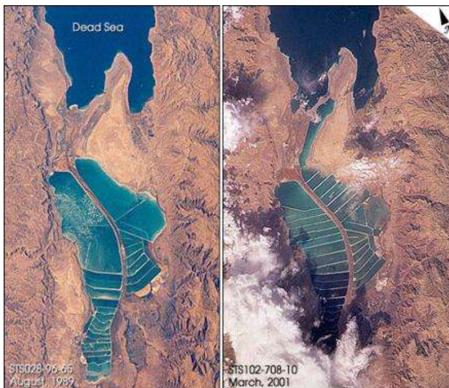
Israel and Jordan launch a joint plan to divert water from the Red Sea to the Dead Sea in order to halt the latter's sea level from continuing to decline.

The Jordanian-Israeli “peace canal 13 ,” or Red-Dead Canal Project, aims to save the Dead Sea from drying up. The Jordanian-Israeli border dissects the Dead Sea and is vital for tourism and natural resources.