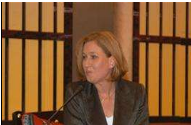
Former Israeli foreign minister Tzipi Livni at the Eighth Doha Forum on Democracy, Development and Free Trade in 2008.

In April 2008, then Israeli foreign minister Tzipi Livni was invited to participate in the Eighth Doha Forum on Democracy, Development and Free Trade. She was also asked to deliver the keynote address. 56