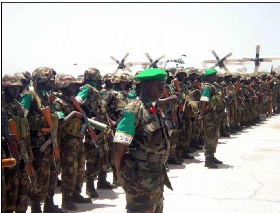
The official Somali army attempts to keep the peace but has lost ground to the Al-Shabaab Islamists.

Since January 1991, Somalia has had no functioning, central government. The country has been divided among militia groups hoping to take control. 43 In south-central Somalia, the armed Islamic organization Al-Shabaab has waged violent attacks against the Christian minority with reports of shootings, beheadings and the imposition of laws restricting faith-based practices. 44