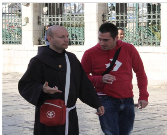
Bethlehem (The Israel Project)

Thirty-five percent of the Christian population in the West Bank migrated between 1967 and 1992 (45 percent to the United States), according to a survey conducted in 1992 by Bernard Sabella of Bethlehem University. 15 After a brief halt because of hopes for a peace settlement following the Oslo Accords in 1993, large-scale emigration resumed in 1997. 16