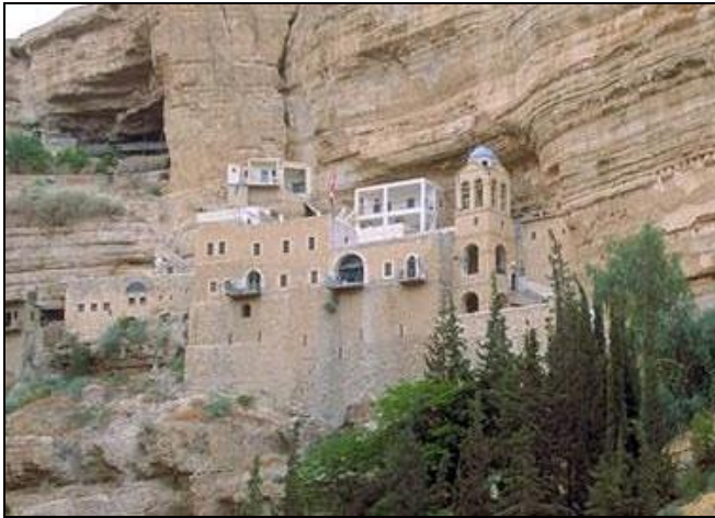
Monastery of St. George.