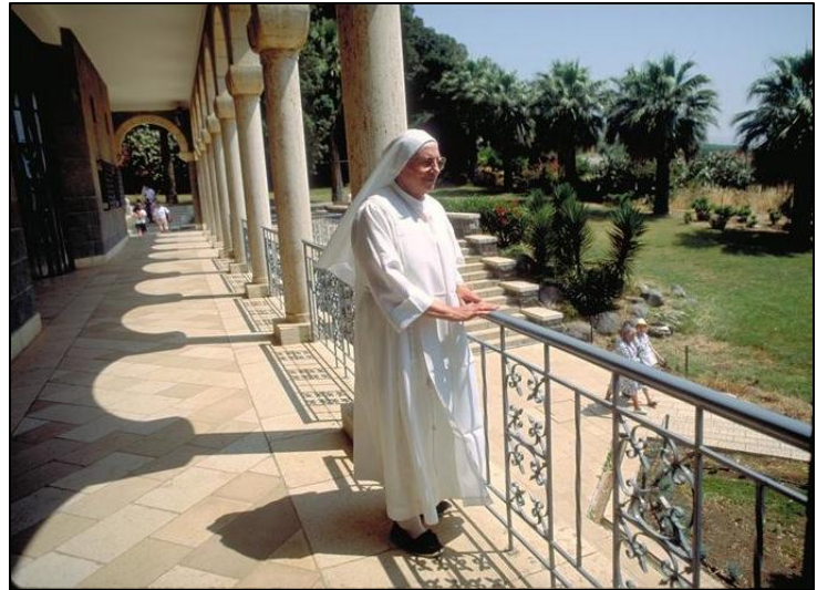
Mount of Beatitudes.

Nestled in the hills overlooking the village is the Byzantine church of the Mount of Beatitudes, on the spot where Jesus delivered his Sermon on the Mount.