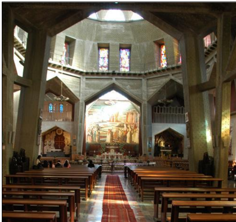
Church of Annunciation. (Israel Wonders)