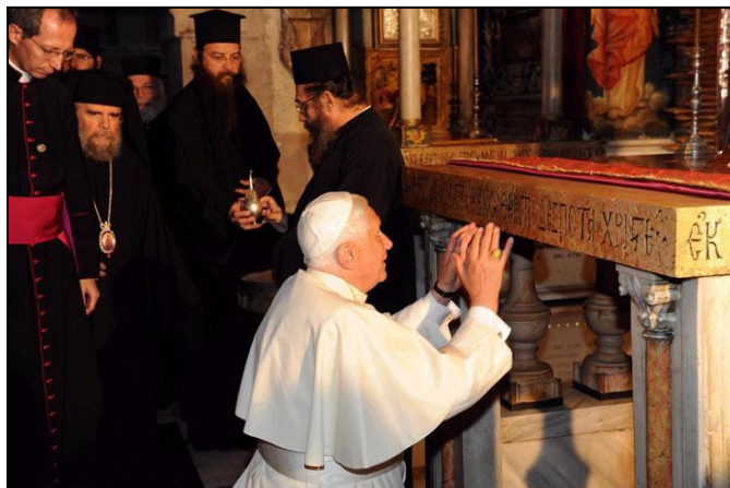
Pope Benedict XVI at Jerusalem's Church of the Holy Sepulcher.

In stark contrast to the bishops who recently used a Vatican synod to blame Israel for oppression of Christians in the Middle East and suggest that the Jews have no claim to that land, Pope Benedict XVI has once again publicly affirmed his warm feelings for both the Jewish people and the State of Israel.