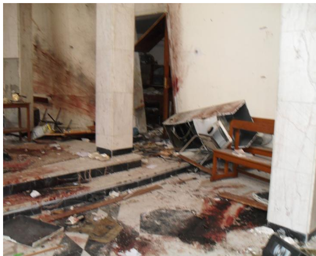
Our Lady of Salvation Catholic Church just hours after 52 worshippers were killed on Oct. 31, 2010. The Islamic State of Iraq terror organization said it was behind the attack. (Mirza Dinnayi)

The Christians of Iraq are beginning to flee after a series of terror attacks targeted churches in Baghdad. However, the Iraqi clergy is urging parishioners to stay. They fear that that a once strong and prosperous population will disappear for good.