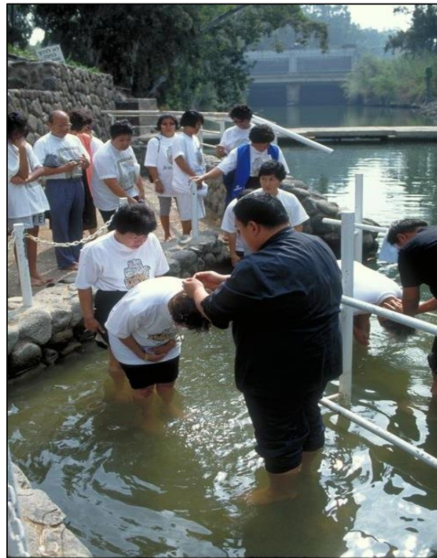
Qasr Al-Yahud. (Israel Wonders)

The Yardenit baptismal site is located at the northern end of the River Jordan where the river exits the Sea of Galilee. This facility includes a visitor center.