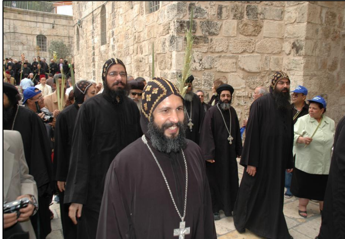
Copts outside the Church of the Holy Sepulcher.

Like The Church of the Nativity, the Church of the Holy Sepulcher includes several places of worship within the one compound. Many Christians believe it to be the site of the crucifixion, burial and resurrection of Jesus.