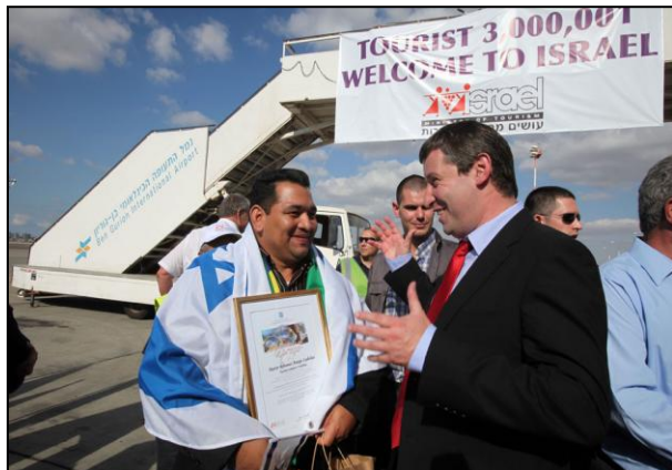
Israeli Tourism Minister Stas Misezhnikov welcomes the 3,000,001 visitor to the country in 2010, Pastor Ribamar Araujo Ladislau

While final figures will only be released next year, the country's Tourism Ministry is optimistic December will bring with it a bumper holiday season.