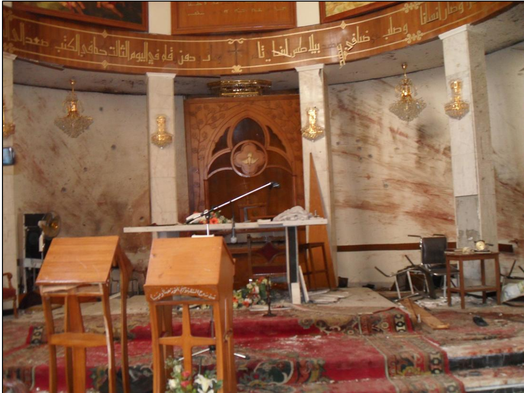
Our Lady of Salvation Catholic Church. (Mirza Dinnayi)