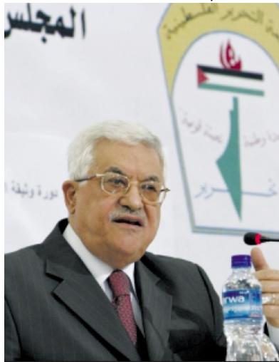
PLO Central Committee meeting [Front page of Al-Ayyam , Nov. 24, 2008]

Similarly, Abbas participated in the PLO Central Committee's meeting [in November 2008] with the PLO symbol, which places the Palestinian flag over the map of Israel, prominently displayed in the background. This symbolizes that all of Israel is, or will someday be, "Palestine."