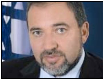
Chairman: Avigdor Liberman