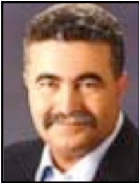
Chairman: Amir Peretz